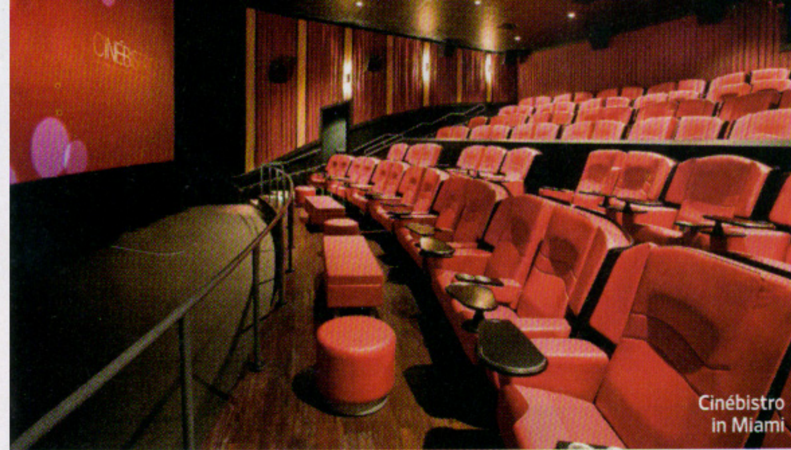
Cinébistro in Miami

Catching the latest new release doesn't have to mean slumming it in run-down, overpriced cineplexes where your feet stick to the floor. Here are eight options that redefine the moviegoing experience. BY KAREN VALBY