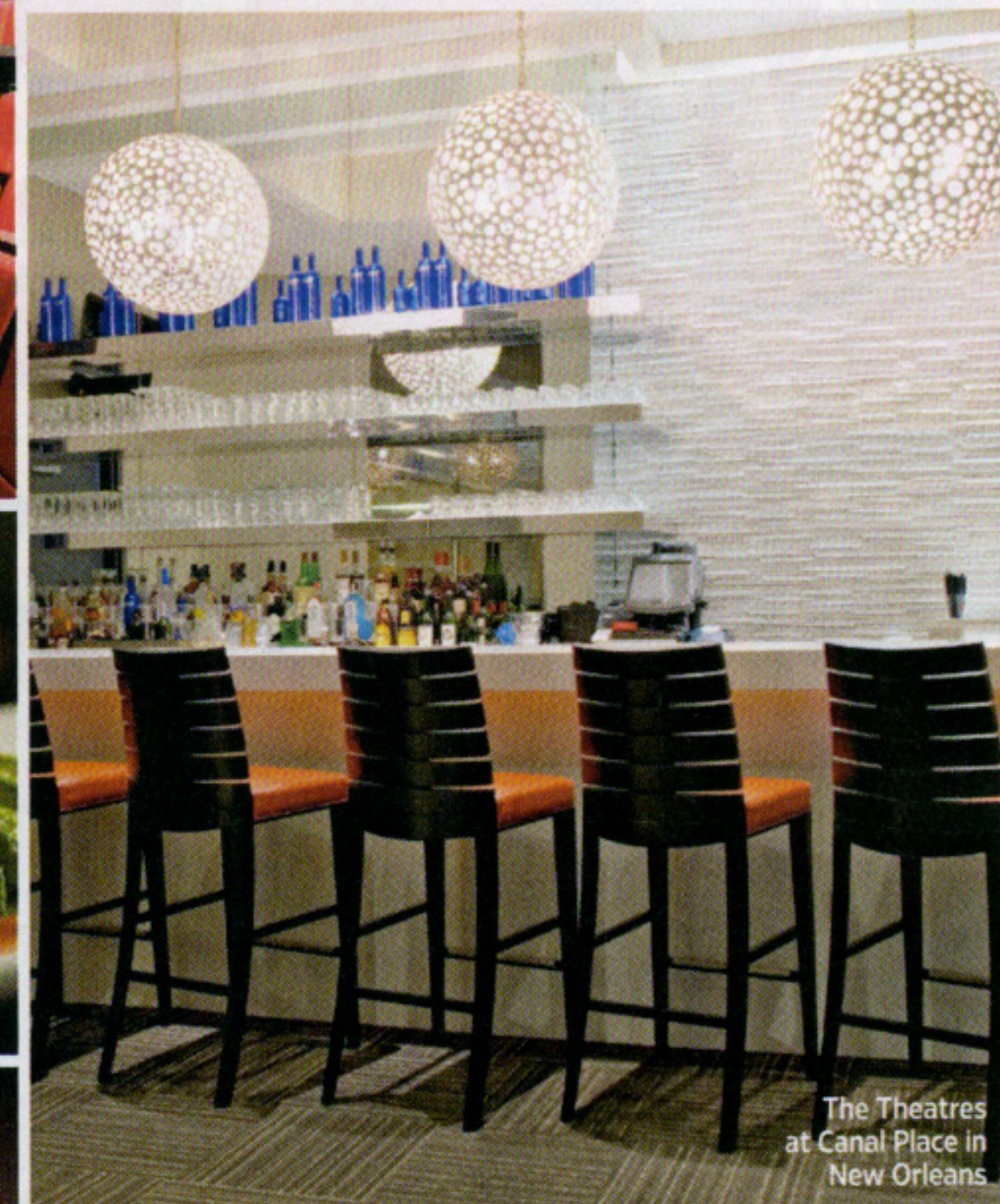
The Theatres at Canal Place in New Orleans